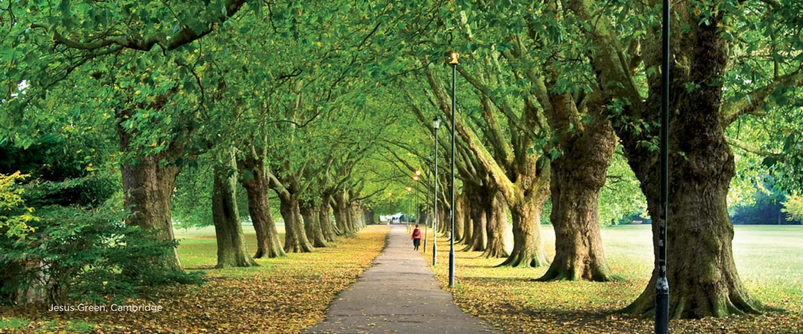
Jesus Green, Cambridge