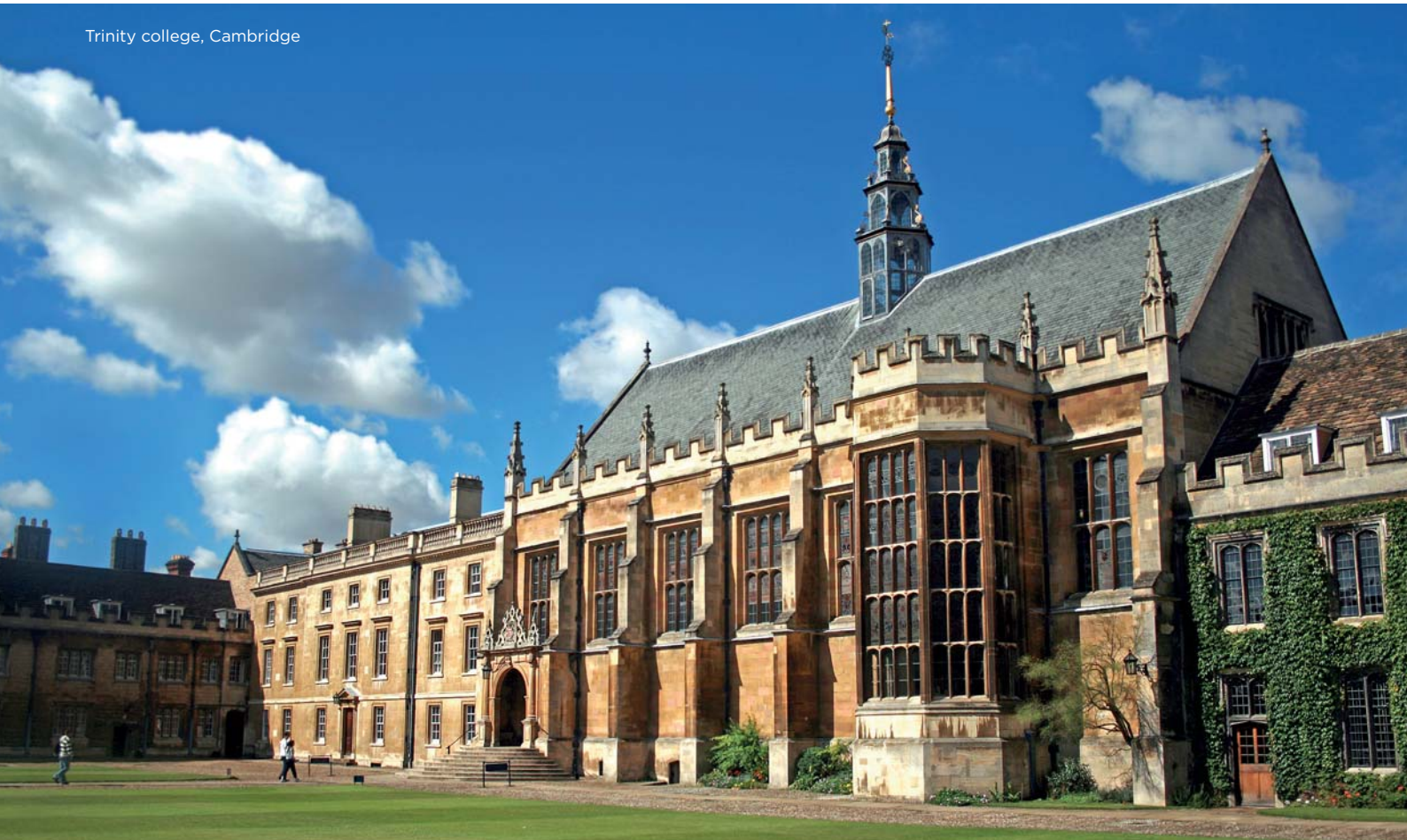
Trinity college, Cambridge

Shared housing is usually a less expensive option and we work closely with a list of approved local landlords to help students get affordable and safe accommodation. We prefer our students to be less than a mile from the college and strongly advise them to cycle into college – Cambridge is a 'Cycle' City.